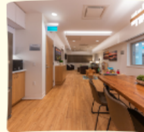
Kamloops Family Room Royal Inland Hospital Opened June 2025

Just steps away from their child's bedside, Family Rooms allow caregivers to rest, grab a quick meal, do some laundry or take a shower, ensuring that whole families are able to stay in their child's fight.