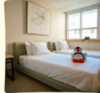
Prince George Family Room University Hospital of Northern BC Opened December 2025